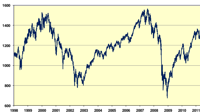
May, 1998 - October, 2011 Secular Bear Market S&P 500 Index

As emotionally wrenching as a cyclical bear market can be, the pain experienced by investors in a secular bear market is usually far worse, because a secular bear market lasts much, much longer. A secular bear market is a long-term trend of 10 to 20 years during which key stock market indices make little or no upward progress. For example, the total return (including dividends reinvested) of the S&P 500 Index for the 11.75-year period from January 1, 2000 through September 30, 2011 was -4.49%. The chart below shows the current 13+ year secular bear market which has so bedeviled investors: