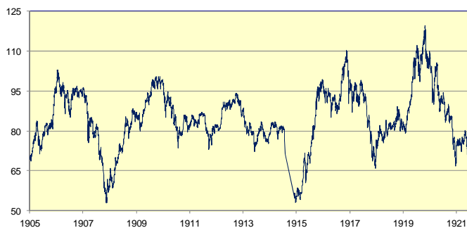
1905-1921 Secular Bear Market Dow Jones Industrial Index

The U.S. is currently in the midst of the fourth secular bear market since 1900. The first secular bear market of the 20th century lasted from 1905 through 1921. It encompassed the Panic of 1907 (when J.P. Morgan kept the U.S. financial system from collapse), World War I (including a period in 1914 when the N.Y. Stock Exchange was shuttered for trading for six months) and its deflationary aftermath. The chart below tells the story: