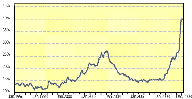
Money Market Assets as % of U.S. Stock Market Capitalization (1996-2008)

In the near term, there is risk that the stock market re-tests the low of 741 which the S&P 500 reached on November 20, 2008. This would be a 12-15% pullback from its current level. The reason for this potential sell-off is that U.S. GDP during the 4 th quarter 2008 probably declined 5% or more, and it is possible that the first quarter 2009 GDP may be nearly as bad. However, as the year progresses, monetary and fiscal stimulus should cause housing prices in most sectors of the country to bottom, and by mid-year, the banks will have written off 75% or more of their problem loans. The huge drop in energy prices will also have the effect of a welcome tax cut for consumers. Finally, the stock market usually rallies 3-6 months before a recession ends. One reason for optimism in this regard is the enormous amount of money market assets on the sidelines waiting for the right moment to re-enter the stock market as shown below: